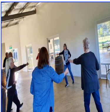
Tai Chi was very popular.