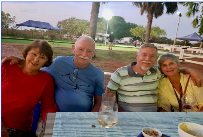
The Bizzills and Footes catching up in Barn Hill. Living the good life!