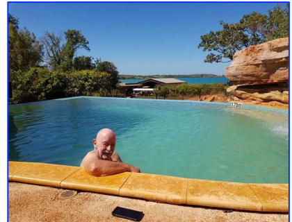
It's a tough life at Cygnet Bay