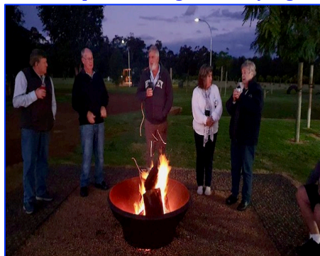
The fire pit was a huge hit every night.