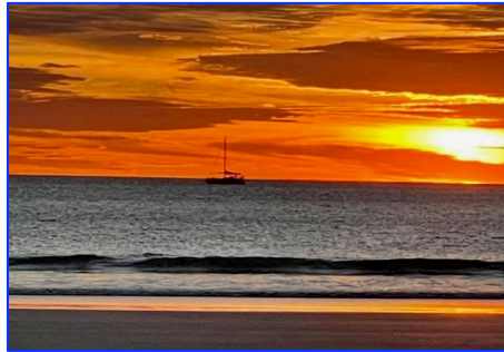
Glorious sunset at Cable Beach.