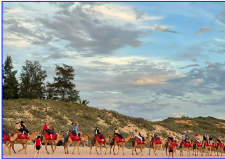
The famous camel rides along Cable Beach.