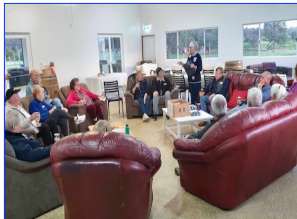
Opening of the Rally in luxurious comfort