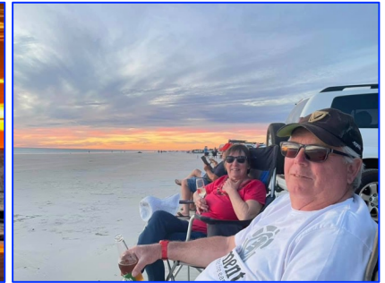
It's an even tougher life on Cable Beach.