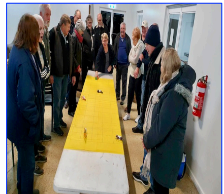
Horse racing Sandgroper style!