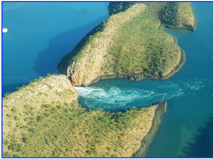
Breathtaking Horizontal Falls

Hello everyone. I hope you are surviving the cold weather without too many aches and pains. Graham and I are heading north for eight weeks in early July to soak up some sunshine and catch up with family and friends. We hope to meet up with fellow Sandgroper along the way. Our Facebook page is a great way of keeping in touch as the following photos show of the Bizzills and Haigs having way too much fun travelling around our beautiful state. It is a private group and only Sandgroper can join. Look up Sandgroper Caravan Club and request to join and I will accept you. In the meantime, enjoy the sunny days and eat plenty of comfort food. Yum! I will keep in touch. Warm regards, Cheryl K/editor